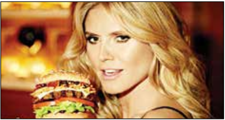
Heidi Klum, Carl’s Jr. TV commercial model