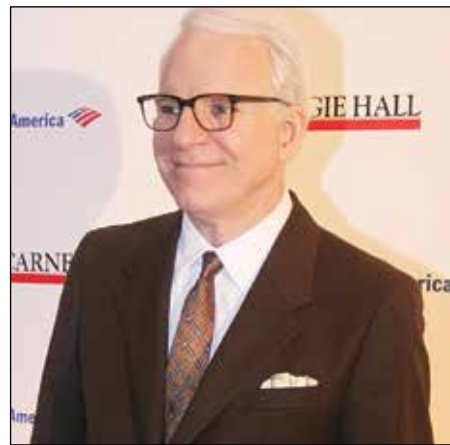
Steve Martin lauded by his peers as he received lifetime achievement award

and others, Steve asked: "How do I top this parade of stars who've been, so, so funny?"